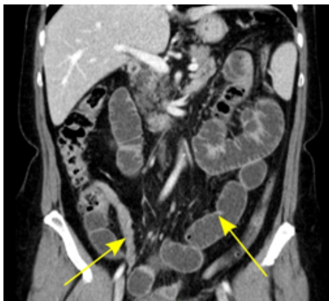
Figure 1 Collapsed terminal ileum (right arrow) and distended fluid-filled small bowel loops (left arrow)