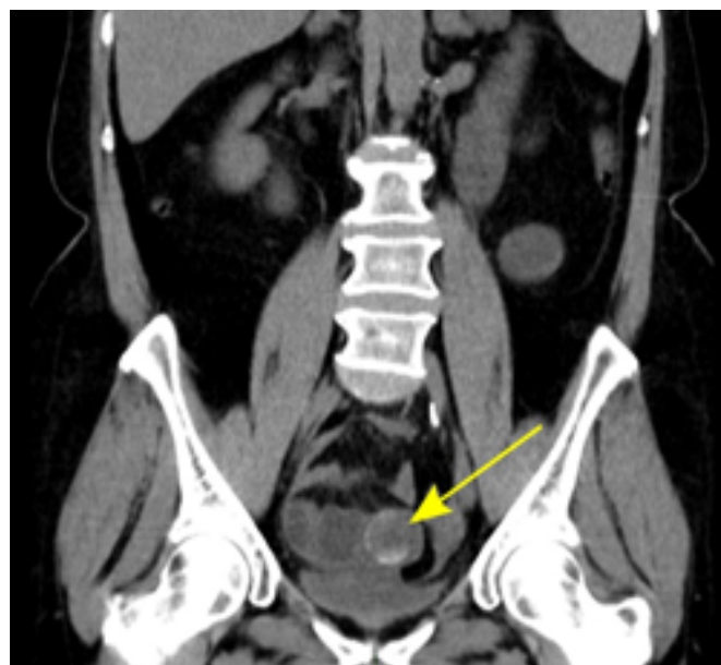
Figure 3. Biliary calculus in the ileal lumen